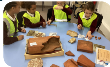
Y4 had a wonderful trip to visit the Verulamium Museum! We were able to see real Roman artefacts

Well done to 6 Lennon this week. The school was selected to take part in NFER trial tests, which help to assess and inform future KS2 SATs for upcoming cohorts. The children represented the school brilliantly; the examiner was extremely impressed with both their behaviour and their approach to learning. They completed three papers: one arithmetic paper and two reasoning papers. We are very proud of their efforts.