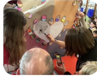
Presentation by Y3-4, inspired by their book: Anisha the accidental detective

I was especially impressed with the literary features they used, including personification, alliteration, similes and onomatopoeia. I even spotted some hyphenated adjectives (usually a Year 6 skill!). I had to pinch myself and double-check that these children were in fact only in Year 4. Well done — keep it up!