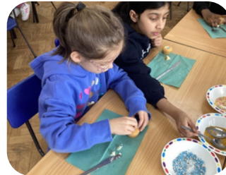
Great British Book Off Cakes inspired by their focus book