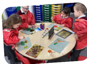
Reception are learning about Van Gogh and exploring his bright colours and bold brushstrokes

Year 6 Parents - Secondary School offers Secondary school offers came out this week, please make sure you check your emails and follow the relevant steps to accept or appeal your offer. For appeals please refer to the Harrow Website: https://www.harrow.gov.uk/schools-learning/appeal-school-place