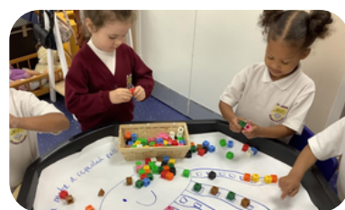
In maths, Nursery have been learning about repeating patterns.