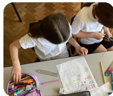
In PSCE, Y4 were designing posters to raise awareness about deforestation, littering, pollution and climate change.

Our Year 3 pupils had a fantastic time on their visit to the History Museum this week, bringing their learning to life beyond the classroom. On Thursday, our talented percussionists performed at Harrow Arts Centre in a truly wonderful event. As always, St John's pupils shone brightly and made us incredibly proud.