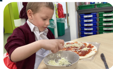
Reception were busy making pizzas this week, linked to their topic on Italy