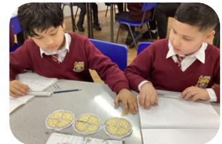
Y4 busy exploring fractions of amounts.

Children have returned to school and settled back into their routines very well. This half term is slightly shorter, with just five teaching weeks, so we will certainly be putting our foot on the accelerator to continue driving progress and securing strong outcomes for all pupils.