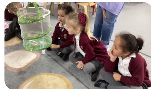
Reception released their butterflies in the forest school this week, after spending last half term observing them grow and transform into cocoons.