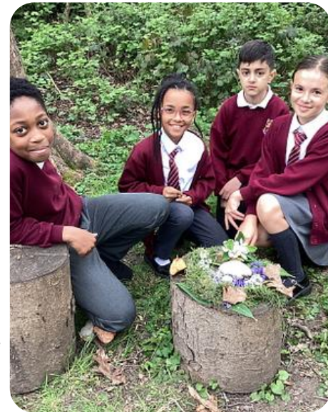
Y5 made outdoor collages inspired by Andy Goldsworthy, using what they foraged in the forest school area.