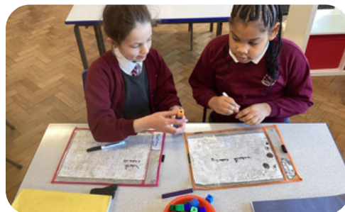
Y4 busy exploring fractions and decimals, using manipulatives to support their understanding